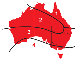
RECs Table – Heat Pump

Not suitable for installation in alpine areas or areas above 1000m.